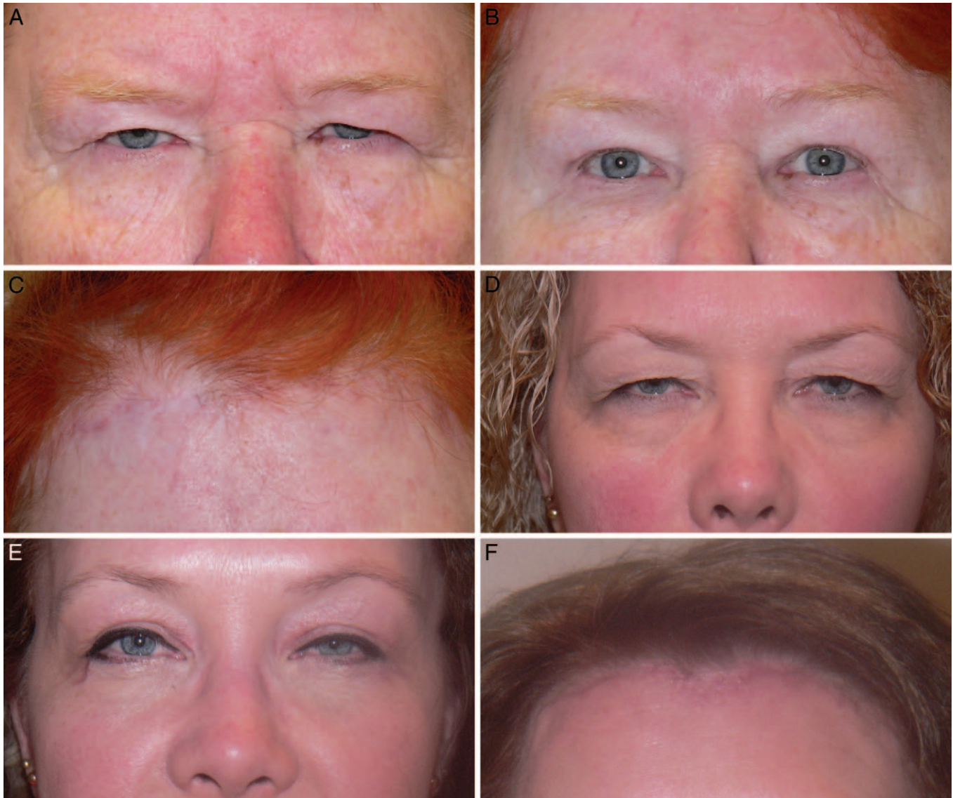
Figure 2. Cosmetic surgery involving forehead and upper lids. (A and B) Before surgery and 4 months after surgery. (C) Incisional scar at 4 months. (D and E) Before surgery and 2 months after surgery. (F) Incisional scar at 2 months. In both cases, upper lid blepharoplasties were performed.

separation. The dehiscences were allowed to heal secondarily, and the resultant scars were mild enough that the patients declined complimentary scar revision. After photographic review, 2 patients were judged to have been undercorrected (Table). Nevertheless, patient satisfaction was high.